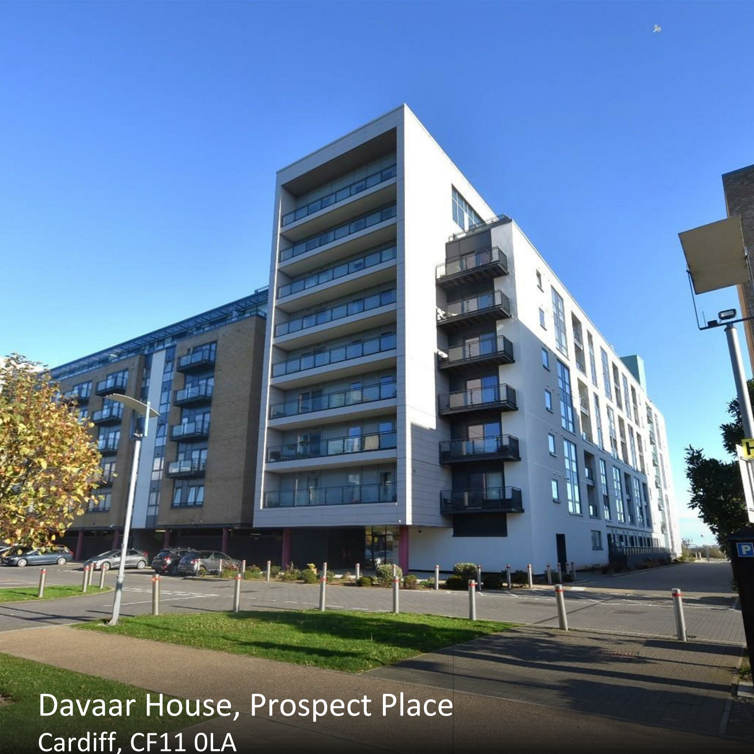
Davaar House, Prospect Place Cardiff, CF11 0LA